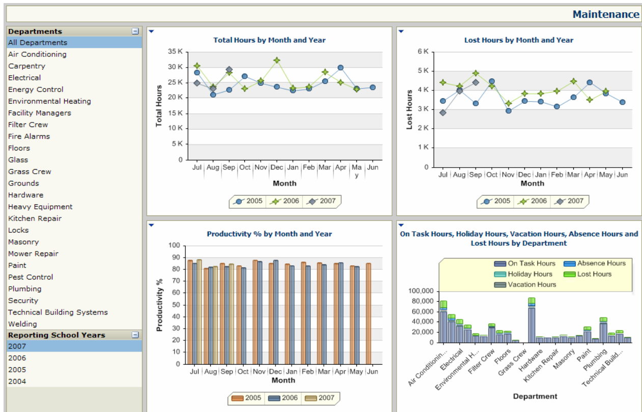
Figure 3. Sample Dashboard for a maintenance department.